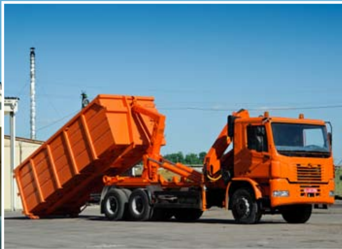
The МПР-2 MultiLift hook system with articulating crane